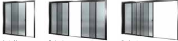
Single slider Double slider Stacking slider