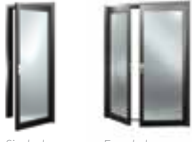
Single door French doors